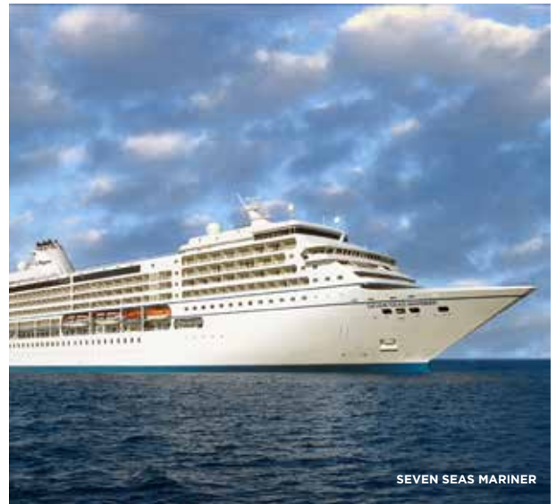
SEVEN SEAS MARINER