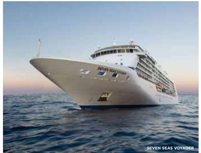
SEVEN SEAS VOYAGER