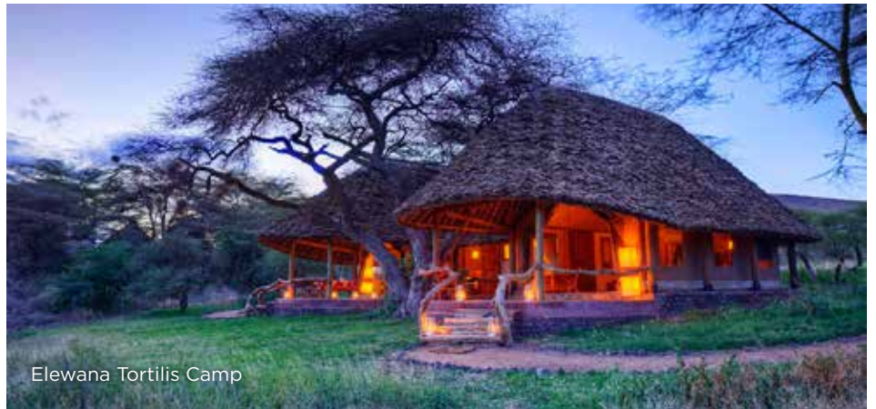
Elewana Tortilis Camp

Elewana Tortilis Camp is situated in one of Amboseli's areas of Acacia Tortilis woodland, with the majestic Mount Kilimanjaro as the backdrop. Game drives, walks, sundowners and bush meals take place inside the park and the private game concession. The tents are all spacious with elegant ensuite bathrooms. There is a main lounge, bar and dining area, all exquisitely built with natural materials and thatched roofs.